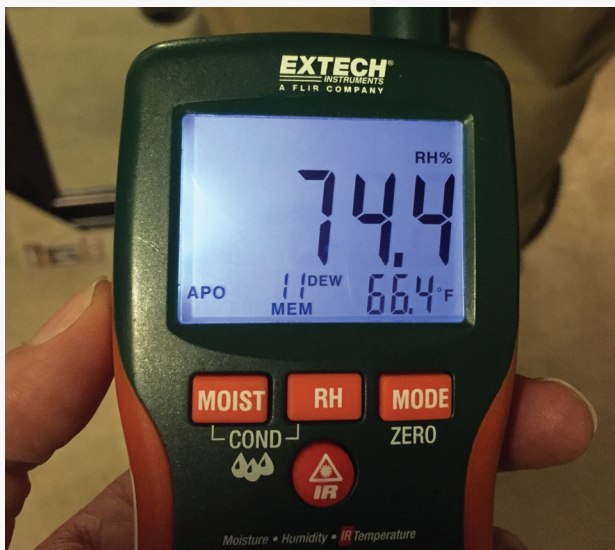
Conditions inside apartment were 74% RH and 66°F.

As it turned out, the two-ton condensing systems were grossly oversized for the one-bedroom units. Further compounding the problem was the humid air being brought in through the fresh air intake. To try and resolve the issue, tenants kept lowering the thermostats and over-cooling the space. Unfortunately, the lower surface temperature increased the interior dew points to a level where sufficient water activity was present to support microbial growth on the walls.