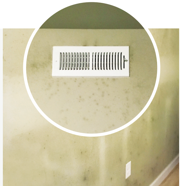
Microbial growth on the walls prior to the installation of an Ultra-Aire MD33 In-Wall Dehumidifier.

An affordable multi-family housing complex in climate zone 4 recently dealt with a significant mold issue caused by excessive humidity in several of the units. The complex, constructed in 2015, was designed and built using energy efficiency best practices. Two-stage cooling equipment was installed with the understanding that the equipment would provide better moisture control. To meet code requirements regarding indoor air contaminants, a fresh air ventilation control and intake damper were installed as well.